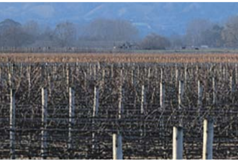
Trinity Hill vineyard