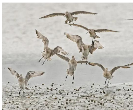
Photo : Godwits/kuaka landing for a feed on the mudbanks (Art Hyde)

On a balmy, end-of-summer day in February, a group of about 40 adults and children listened to the godwit/kuaka story and walked to view the birds roosting in The Scrapes (Westshore Wildlife Reserve) at high tide. Thank you for the generosity of the BirdsNZ members who bring their scopes for better viewing. We also offered the opportunity to airport staff to learn about these birds and gave them a 'tour' in February also.