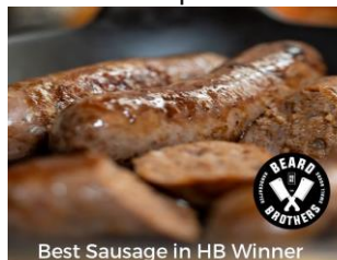
Best Sausage in HB Winner